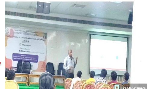
Workshop on Network Simulation Tool (ns-3)