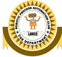
Robotic Process Automation Club (RPAC)