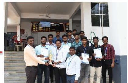
JNTUK Central Zone Cricket Winners