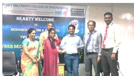
Workshop for Students on Cyber Security