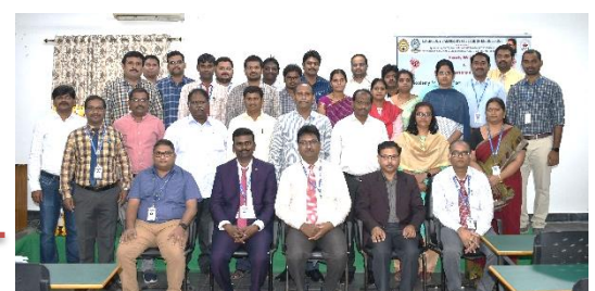
FDP on Data Analysis Tools & Techniques for Text and Speech Analytics