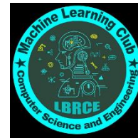
Machine Learning Club (MLC)