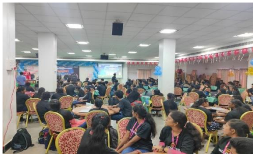
Students Participation in 24 Hours Hackathon