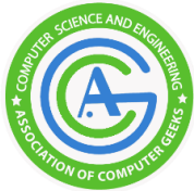
Association of Computer Geeks (ACG)