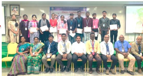
Engineer's Day Celebrations