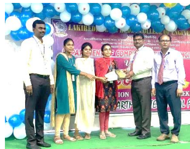
Student Winners in ACG - 2k23 (Association Day)