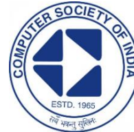
CSI - Student Branch