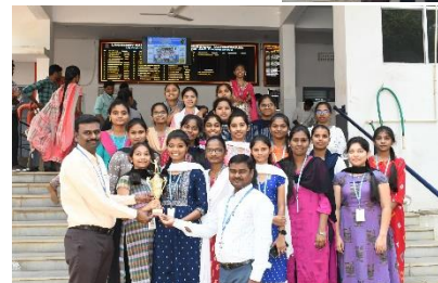
JNTUK Central Zone Kho-Kho Winners